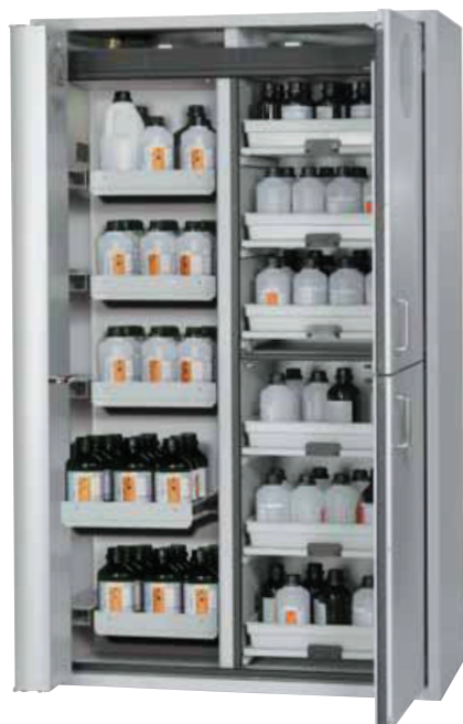
Model VBFT.SL+ VBFT with 5 drawers / SL with 6 pull-out shelves incl. PP trays