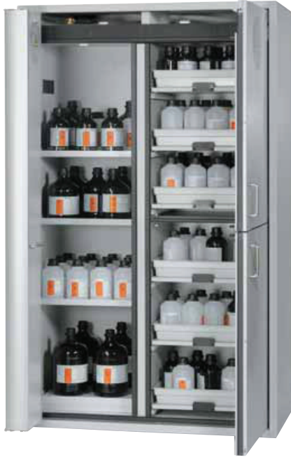
Model VBFT.SL+ VBFT with 4 shelves / SL with 6 pull-out shelves incl. PP trays