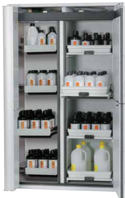
Model VBFT.SL+ VBFT with 4 drawers / SL with 4 pull-out shelves incl. PP trays

Compartment VBFT Door open arrest system + TSA - Automatic door closing system ➔ fitted as standard