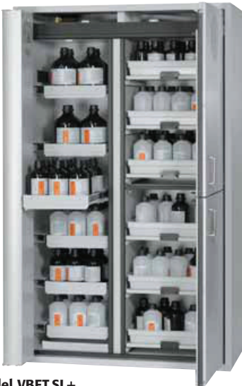
Model VBFT.SL+ VBFT with 6 drawers / SL with 6 pull-out shelves incl. PP tray

Approved storage of hazardous materials in workrooms in accordance with EN 14470-1 (Type 90) and other chemicals (acids and alkalis)