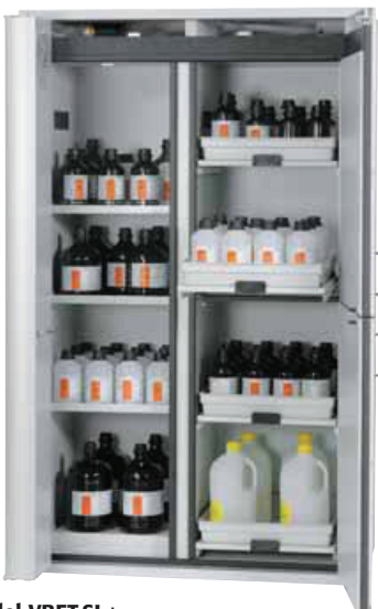
Model VBFT.SL+ VBFT with 4 shelves / SL with 4 pull-out shelves incl. PP tray