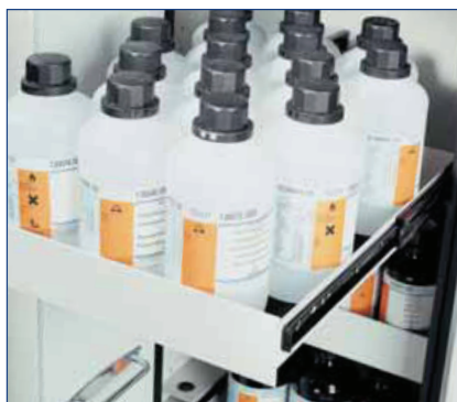
Drawers for storage inside the fire resistant folding door cabinet. Safe and convenient storage and removal of small containers.