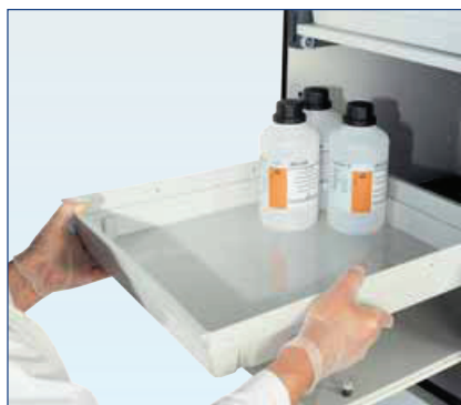
Pull-out shelves in the cabinet for acids and alkalis. Sturdy construction with removable PP trays.