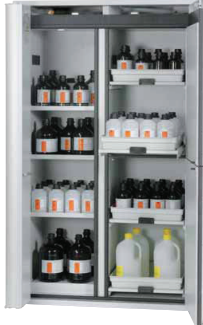
Model VBFT.SL+ VBFT with 4 shelves / SL with 4 pull-out shelves incl. PP trays