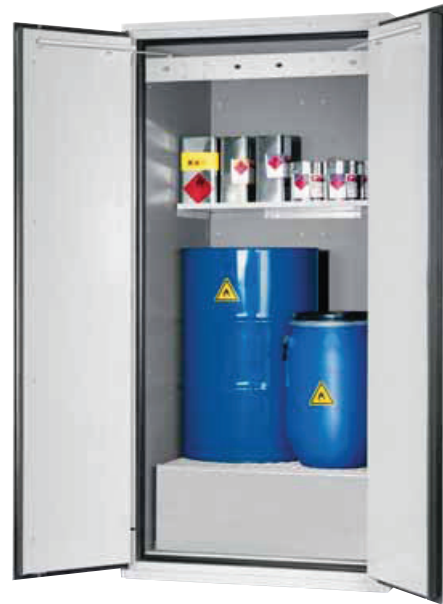
Model VBF.221.108 with additional shelf (page 68)