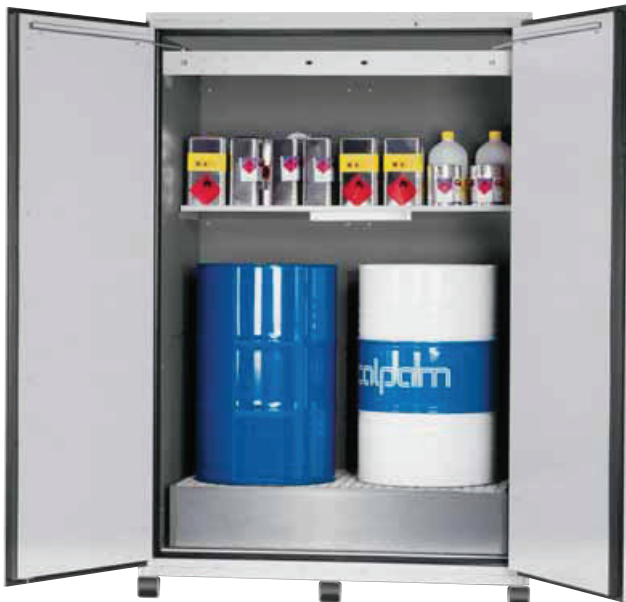
Model VBF.221.153 with additional shelf and plinth (page 69)