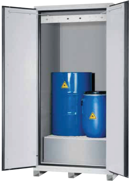
Model VBF.221.108 with additional plinth (page 68)