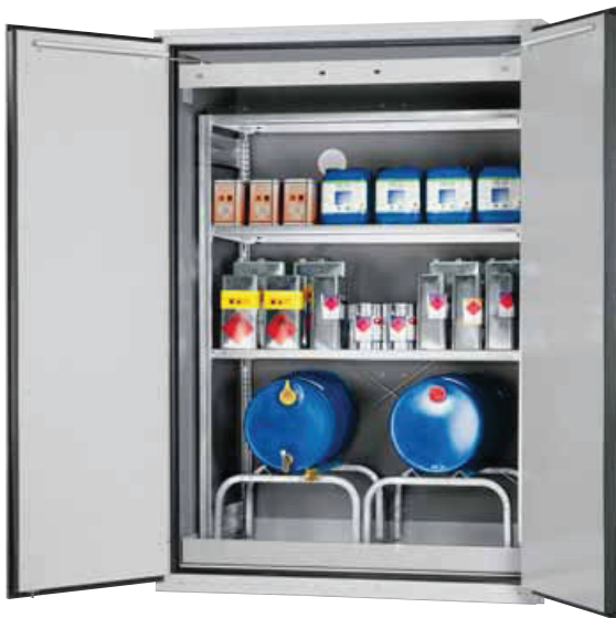
Model VBF.221.153 with rack system and two drum mounts