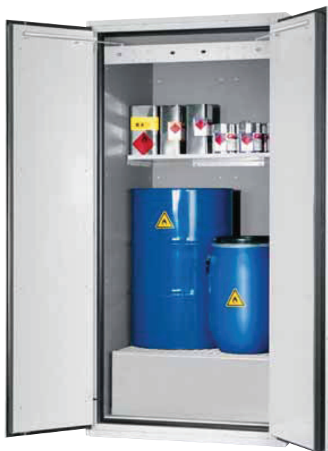
Model VBF.221.108 with additional shelf