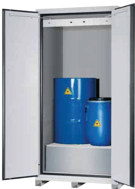
Model VBF.221.108 with additional plinth